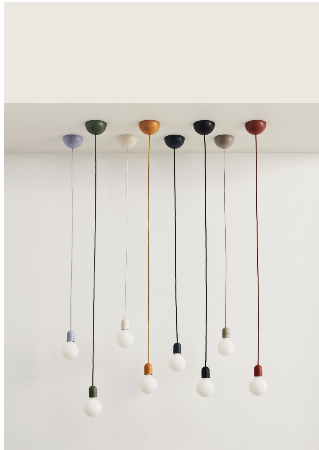
Common Pendant Cord Set

The Common Cord Set is a versatile cord set with components in matching colours. Available in two variants – for pendants and table lamps – the set is compatible with numerous HAY shades and can also be used alone with an E27 bulb. Both models are available in numerous colour options to create a functional and colourful lighting solution. Please note that bulbs are not included.