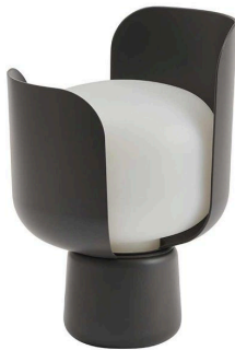
Table lamp with diffused light adjustable by moving the petals. Frame made of painted aluminium with polycarbonate petals. Diffuser made of milk-white and opaline polyethylene. Transparent power cable, plug and switch. European two-pole plug. Bulb not included.

Blom is a small table lamp by Andreas Engesvik, a Norwegian designer who has made a name for himself on the international scene thanks to his ability to instil emotions, appeal and ideas into everyday objects. Taking up very little space, just 24 cm tall with a diameter of 15 cm, Blom is a light, fun lamp that is easy to pick up and move and suitable for any purpose. Its name, a contraction of the word blomst, which in Norwegian means flower, is inspired by its petal shaped blades. Intensity can be adjusted thanks to the two petals that gently embrace the diffuser, rotating on the base to shield the glare depending on personal requirements: with the petals aligned the lamp emits maximum light. The compact fluorescent bulb guarantees good effective lighting with low energy consumption. The metal base ensures stability for the lamp and when lit, the polycarbonate petals maintain a temperature that permits touching without the risk of burns. Blom is an article that adapts perfectly to contemporary living trends, at home on a table in the lounge or even by a bedside.