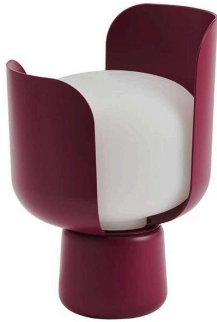
Table lamp with diffused light adjustable by moving the petals. Frame made of painted aluminium with polycarbonate petals. Diffuser made of milk-white and opaline polyethylene. Transparent power cable, plug and switch. European two-pole plug. Bulb not included.

Blom is a small table lamp by Andreas Engesvik, a Norwegian designer who has made a name for himself on the international scene thanks to his ability to instil emotions, appeal and ideas into everyday objects. Taking up very little space, just 24 cm tall with a diameter of 15 cm, Blom is a light, fun lamp that is easy to pick up and move and suitable for any purpose. Its name, a contraction of the word blomst, which in Norwegian means flower, is inspired by its petal shaped blades. Intensity can be adjusted thanks to the two petals that gently embrace the diffuser, rotating on the base to shield the glare depending on personal requirements: with the petals aligned the lamp emits maximum light. The compact fluorescent bulb guarantees good effective lighting with low energy consumption. The metal base ensures stability for the lamp and when lit, the polycarbonate petals maintain a temperature that permits touching without the risk of burns. Blom is an article that adapts perfectly to contemporary living trends, at home on a table in the lounge or even by a bedside.