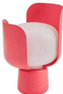
Table lamp with diffused light adjustable by moving the petals. Frame made of painted aluminium with polycarbonate petals. Diffuser made of milk-white and opaline polyethylene. Transparent power cable, plug and switch. European two-pole plug. Bulb not included.

Blom is a small table lamp by Andreas Engesvik, a Norwegian designer who has made a name for himself on the international scene thanks to his ability to instil emotions, appeal and ideas into everyday objects. Taking up very little space, just 24 cm tall with a diameter of 15 cm, Blom is a light, fun lamp that is easy to pick up and move and suitable for any purpose. Its name, a contraction of the word blomst, which in Norwegian means flower, is inspired by its petal shaped blades. Intensity can be adjusted thanks to the two petals that gently embrace the diffuser, rotating on the base to shield the glare depending on personal requirements: with the petals aligned the lamp emits maximum light. The compact fluorescent bulb guarantees good effective lighting with low energy consumption. The metal base ensures stability for the lamp and when lit, the polycarbonate petals maintain a temperature that permits touching without the risk of burns. Blom is an article that adapts perfectly to contemporary living trends, at home on a table in the lounge or even by a bedside.