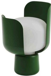
Table lamp with diffused light adjustable by moving the petals. Frame made of painted aluminium with polycarbonate petals. Diffuser made of milk-white and opaline polyethylene. Transparent power cable, plug and switch. European two-pole plug. Bulb not included.

Blom is a small table lamp by Andreas Engesvik, a Norwegian designer who has made a name for himself on the international scene thanks to his ability to instil emotions, appeal and ideas into everyday objects. Taking up very little space, just 24 cm tall with a diameter of 15 cm, Blom is a light, fun lamp that is easy to pick up and move and suitable for any purpose. Its name, a contraction of the word blomst, which in Norwegian means flower, is inspired by its petal shaped blades. Intensity can be adjusted thanks to the two petals that gently embrace the diffuser, rotating on the base to shield the glare depending on personal requirements: with the petals aligned the lamp emits maximum light. The compact fluorescent bulb guarantees good effective lighting with low energy consumption. The metal base ensures stability for the lamp and when lit, the polycarbonate petals maintain a temperature that permits touching without the risk of burns. Blom is an article that adapts perfectly to contemporary living trends, at home on a table in the lounge or even by a bedside.