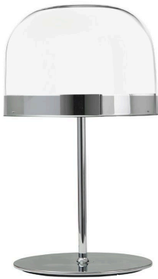
Table lamp with diffused and dimmable light generated by led inserted into two overlapping polycarbonate discs. The bottom disc produces a downward light output, the upper one illuminates the glass cover. Galvanized metal frame. Transparent glass diffuser. Black power cable, dimmer and plug. Plug-in power supply with interchangeable plugs (UK, USA, UE, AUSTRALIA). Integrated led.

Equatore is a contemporary reinterpretation of the classic lamp with a glass shade. While the traditional abat-jour uses the shade to contain the light source within, in this family of lamps the shade is paradoxically and suggestively empty, with the light being generated by two luminous discs placed inside a central metal band, visible on the shade, that evokes the line of the equator. The light produced by the Leds, thanks to internal screens arranged in layers, is distributed regularly across the surface of the discs, magically illuminating them. The bottom disc directs the light output downward, the upper one illuminates the glass cap for a soft, diffused light. Available in table, floor and ceiling models, in two sizes and four colors.