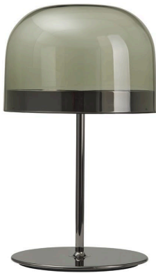
Table lamp with diffused and dimmable light generated by led inserted into two overlapping polycarbonate discs. The bottom disc produces a downward light output, the upper one illuminates the colored glass cover. Galvanized metal frame. Transparent glass diffuser. Black power cable, dimmer and plug. Plug-in power supply with interchangeable plugs (UK, USA, UE, AUSTRALIA). Integrated led.

Equatore is a contemporary reinterpretation of the classic lamp with a glass shade. While the traditional abat-jour uses the shade to contain the light source within, in this family of lamps the shade is paradoxically and suggestively empty, with the light being generated by two luminous discs placed inside a central metal band, visible on the shade, that evokes the line of the equator. The light produced by the Leds, thanks to internal screens arranged in layers, is distributed regularly across the surface of the discs, magically illuminating them. The bottom disc directs the light output downward, the upper one illuminates the glass cap for a soft, diffused light. Available in table, floor and ceiling models, in two sizes and four colors.