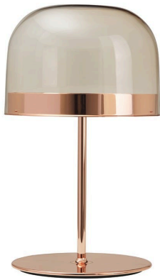
Table lamp with diffused and dimmable light generated by led inserted into two overlapping polycarbonate discs. The bottom disc produces a downward light output, the upper one illuminates the colored glass cover. Galvanized metal frame. Transparent glass diffuser. Black power cable, dimmer and plug. Plug-in power supply with interchangeable plugs (UK, USA, UE, AUSTRALIA). Integrated led.

Equatore is a contemporary reinterpretation of the classic lamp with a glass shade. While the traditional abat-jour uses the shade to contain the light source within, in this family of lamps the shade is paradoxically and suggestively empty, with the light being generated by two luminous discs placed inside a central metal band, visible on the shade, that evokes the line of the equator. The light produced by the Leds, thanks to internal screens arranged in layers, is distributed regularly across the surface of the discs, magically illuminating them. The bottom disc directs the light output downward, the upper one illuminates the glass cap for a soft, diffused light. Available in table, floor and ceiling models, in two sizes and four colors.