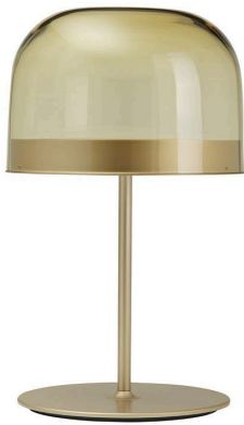
Table lamp with diffused and dimmable light generated by led inserted into two overlapping polycarbonate discs. The bottom disc produces a downward light output, the upper one illuminates the glass cover. Painted metal frame. Diffuser made of transparent and coloured glass. Black power cable, dimmer and plug. Plug-in power supply with interchangeable plugs (UK, USA, UE, AUSTRALIA). Integrated led.

Equatore is a contemporary reinterpretation of the classic lamp with a glass shade. While the traditional abat-jour uses the shade to contain the light source within, in this family of lamps the shade is paradoxically and suggestively empty, with the light being generated by two luminous discs placed inside a central metal band, visible on the shade, that evokes the line of the equator. The light produced by the Leds, thanks to internal screens arranged in layers, is distributed regularly across the surface of the discs, magically illuminating them. The bottom disc directs the light output downward, the upper one illuminates the glass cap for a soft, diffused light. Available in table, floor and ceiling models, in two sizes and four colors.