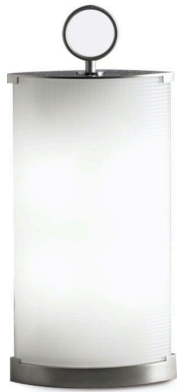
Table lamp with diffused and dimmable light. Frame made of nickel-plated metal. Diffuser made of curved pressed glass. Transparent power cable, dimmer and plug. European two-pole plug. Bulb not included.

Pirellone and Pirellina have been lighting classics for 40 years. Two pieces of curved glass held in place by metal elements at the base and the top: the secret of this simple structure lies in the use of special impact-resistant glass.