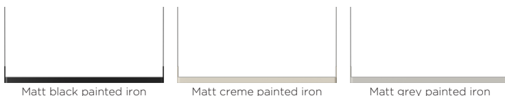
Matt black painted iron