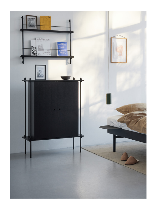
Double Height Cabinets - just like a regular cabinet, but bigger. The new Double Height Cabinets fit seamlessly into the MOEBE Shelving System, and greatly expand the storage capacity by allowing for up to seven internal shelves to be added.