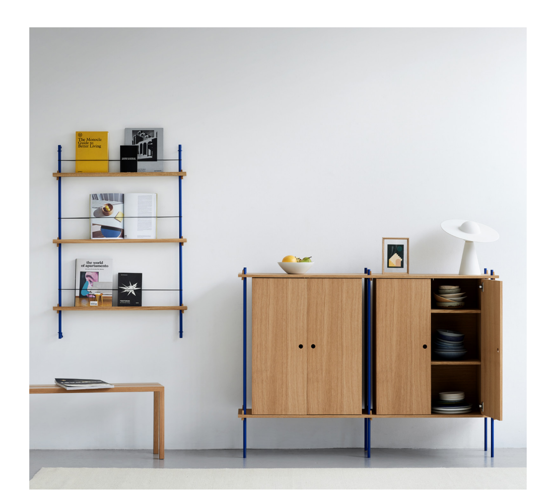
Introducing two new storage additions to the MOEBE Shelving System.