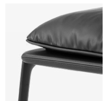
Noble Aniline Leather Black