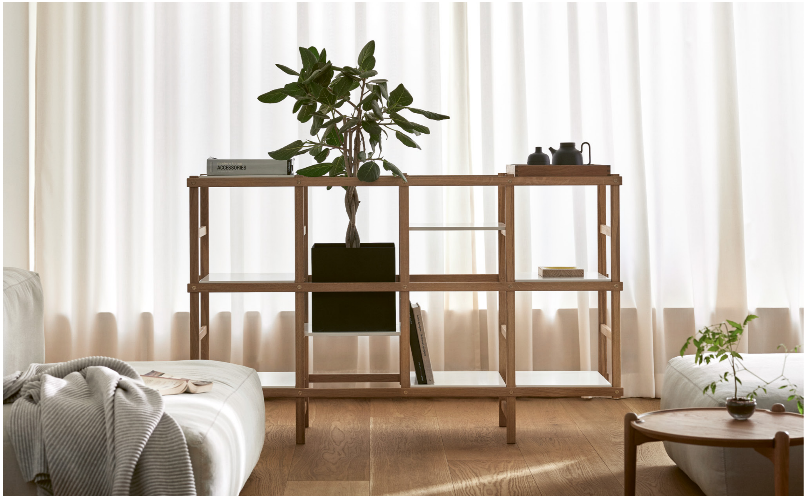
Frame (Medium) by Harald Hermanrud Pleece (Throw, Light Grey) by Marianne Abellson Botanic (Pedestal Pot) by Atelier 2+