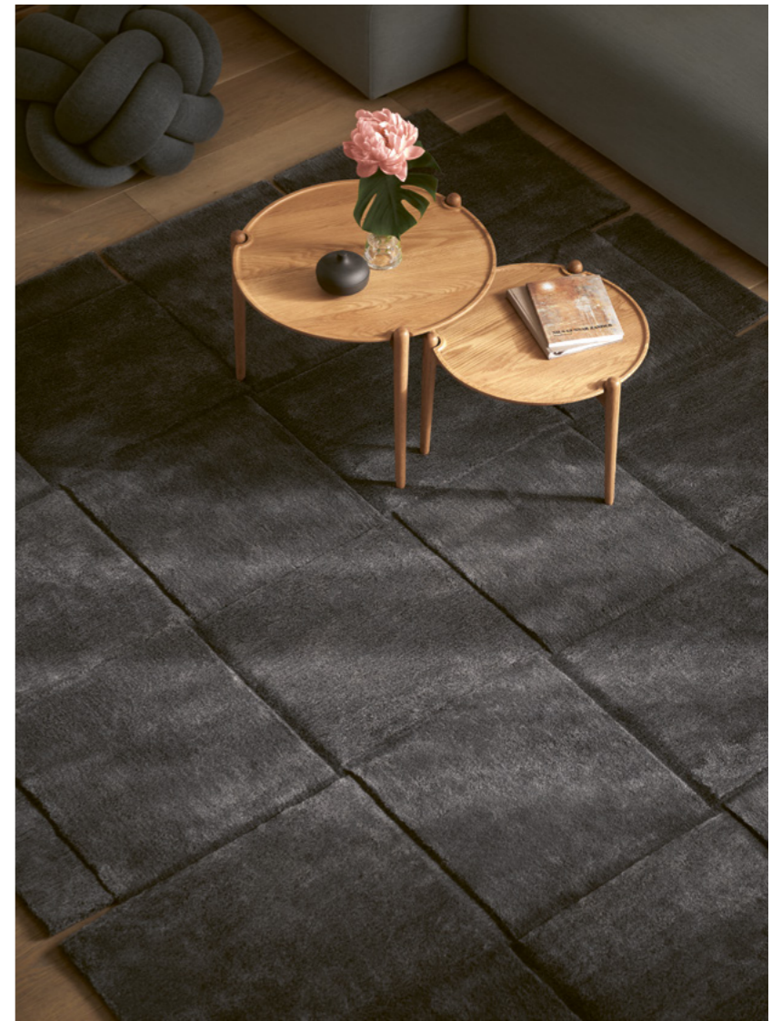
Aria Table (High & Low, Oak) by Dögg Guðmundsdóttir Björk Rug (200×300 cm, Blue) by Lena Bergström Knot Cushion (Mint Green) by Ragnheiður Ösp Sigurðardóttir ← BonBon Vase (Medium) by Eva Schildt