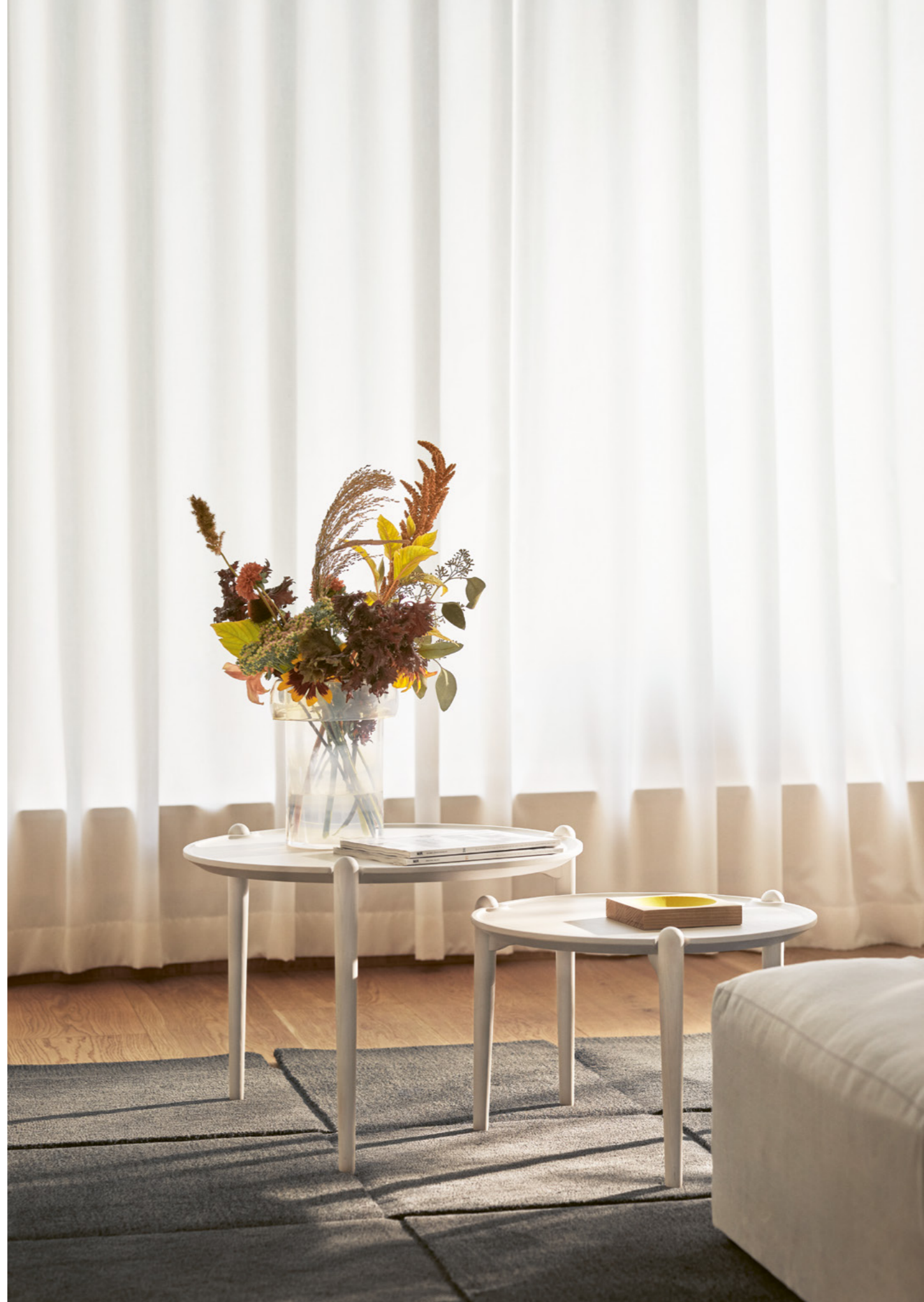
Basket Rug (Dark Grey) by Lena Bergström → Aria Table (High & Low, Stained White/Grey) by Dögg Guðmundsdóttir