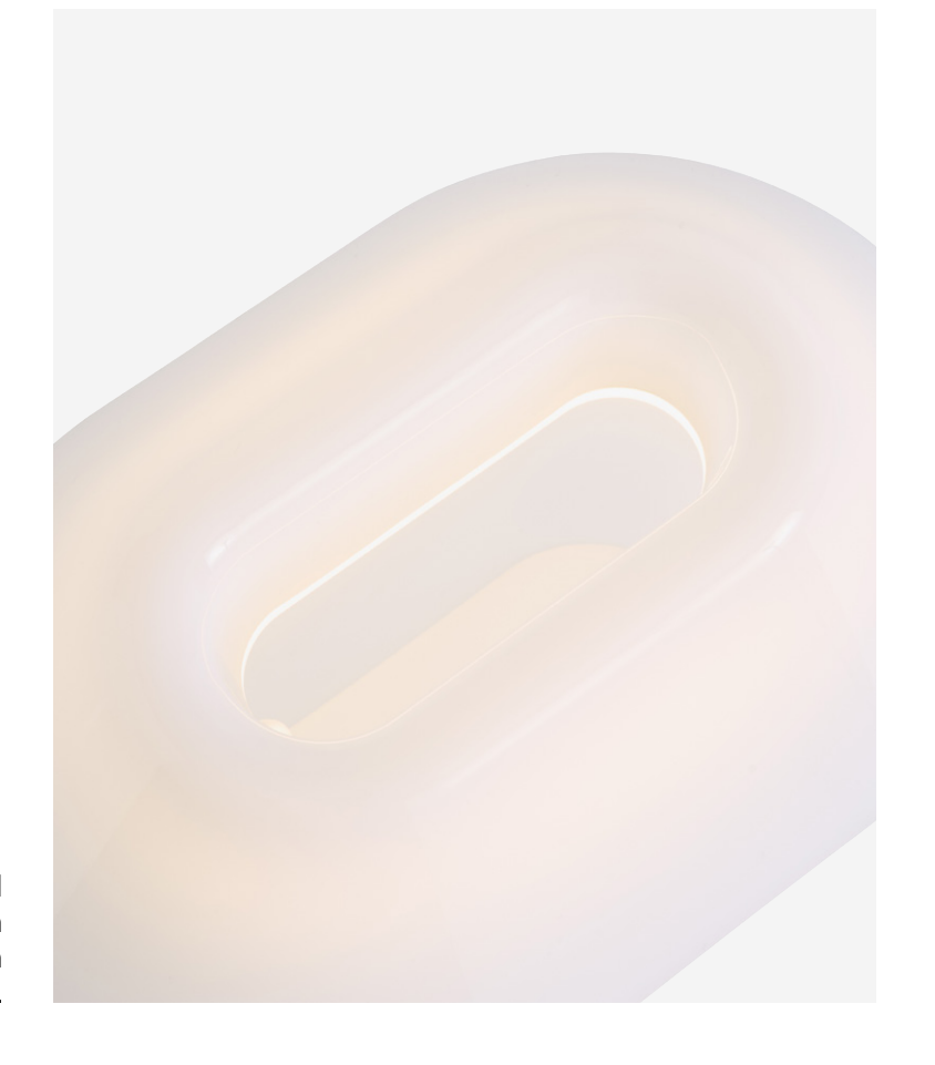
The lamp's stretched elliptical form changes the perception of the lamp, depending on which angle it is viewed from.