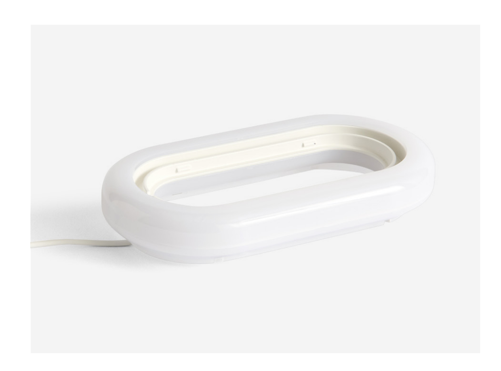
Concealed inside the hollow form is a replaceable integrated LED light source that brings soft, ambient light to its surroundings.