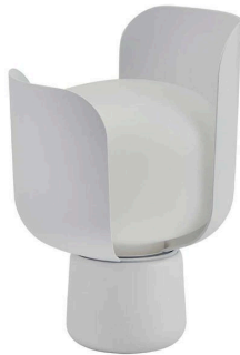
Table lamp with diffused light adjustable by moving the petals. Frame made of painted aluminium with polycarbonate petals. Diffuser made of milk-white and opaline polyethylene. Transparent power cable, plug and switch. European two-pole plug. Bulb not included.

Blom is a small table lamp by Andreas Engesvik, a Norwegian designer who has made a name for himself on the international scene thanks to his ability to instil emotions, appeal and ideas into everyday objects. Taking up very little space, just 24 cm tall with a diameter of 15 cm, Blom is a light, fun lamp that is easy to pick up and move and suitable for any purpose. Its name, a contraction of the word blomst, which in Norwegian means flower, is inspired by its petal shaped blades. Intensity can be adjusted thanks to the two petals that gently embrace the diffuser, rotating on the base to shield the glare depending on personal requirements: with the petals aligned the lamp emits maximum light. The compact fluorescent bulb guarantees good effective lighting with low energy consumption. The metal base ensures stability for the lamp and when lit, the polycarbonate petals maintain a temperature that permits touching without the risk of burns. Blom is an article that adapts perfectly to contemporary living trends, at home on a table in the lounge or even by a bedside.