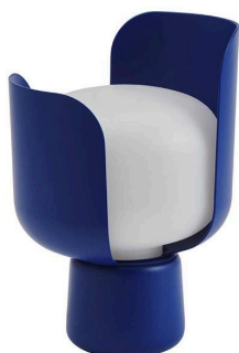
Table lamp with diffused light adjustable by moving the petals. Frame made of painted aluminium with polycarbonate petals. Diffuser made of milk-white and opaline polyethylene. Transparent power cable, plug and switch. European two-pole plug. Bulb not included.

Blom is a small table lamp by Andreas Engesvik, a Norwegian designer who has made a name for himself on the international scene thanks to his ability to instil emotions, appeal and ideas into everyday objects. Taking up very little space, just 24 cm tall with a diameter of 15 cm, Blom is a light, fun lamp that is easy to pick up and move and suitable for any purpose. Its name, a contraction of the word blomst, which in Norwegian means flower, is inspired by its petal shaped blades. Intensity can be adjusted thanks to the two petals that gently embrace the diffuser, rotating on the base to shield the glare depending on personal requirements: with the petals aligned the lamp emits maximum light. The compact fluorescent bulb guarantees good effective lighting with low energy consumption. The metal base ensures stability for the lamp and when lit, the polycarbonate petals maintain a temperature that permits touching without the risk of burns. Blom is an article that adapts perfectly to contemporary living trends, at home on a table in the lounge or even by a bedside.