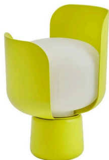
Table lamp with diffused light adjustable by moving the petals. Frame made of painted aluminium with polycarbonate petals. Diffuser made of milk-white and opaline polyethylene. Transparent power cable, plug and switch. European two-pole plug. Bulb not included.

Blom is a small table lamp by Andreas Engesvik, a Norwegian designer who has made a name for himself on the international scene thanks to his ability to instil emotions, appeal and ideas into everyday objects. Taking up very little space, just 24 cm tall with a diameter of 15 cm, Blom is a light, fun lamp that is easy to pick up and move and suitable for any purpose. Its name, a contraction of the word blomst, which in Norwegian means flower, is inspired by its petal shaped blades. Intensity can be adjusted thanks to the two petals that gently embrace the diffuser, rotating on the base to shield the glare depending on personal requirements: with the petals aligned the lamp emits maximum light. The compact fluorescent bulb guarantees good effective lighting with low energy consumption. The metal base ensures stability for the lamp and when lit, the polycarbonate petals maintain a temperature that permits touching without the risk of burns. Blom is an article that adapts perfectly to contemporary living trends, at home on a table in the lounge or even by a bedside.