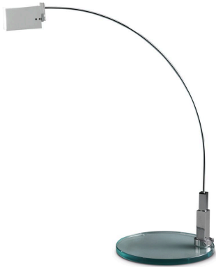
Table lamp directional light and double light intensity not dimmable. Frame made of chromed metal with 360° adjustable body. Cut float glass base. Pivoting diffuser fins made of anodized aluminium. Protection screen of the bulb made of sandblasted glass. Electrical connection between base and body through jack. Black power cable, switch and plug. European two-pole plug power supply. Bulb not included.

Lightness and elegance for this family of lamps designed by Alvaro Siza and available in floor, table and wall versions. Adjustable body and diffuser wings for complete management of light.