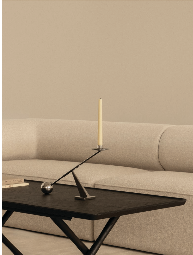
JÄGER LOUNGE TABLE, BLACK LACQUERED Designed by Mogens Lassen